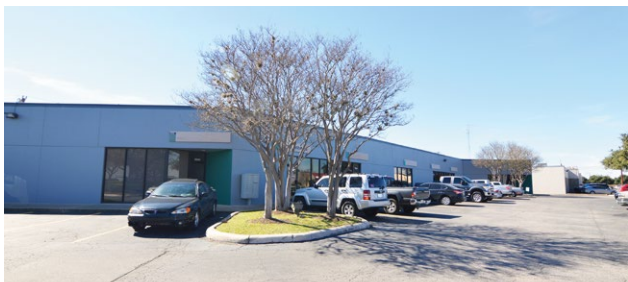
BLDG F: BOARDWALK ST. $9.75/SF | OPEX - $3.34/SF