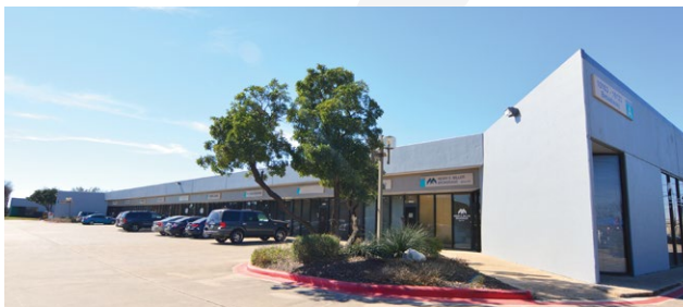
BLDG A: BROADWAY ST. $9.75/SF | OPEX - $3.64/SF