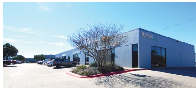
BLDG C: BOARDWALK ST. $9.75/SF | OPEX - $3.64/SF