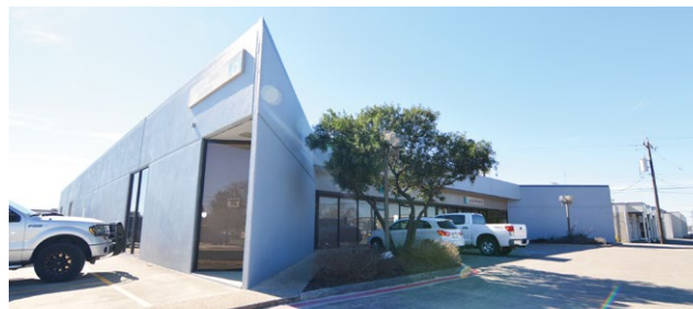
BLDG D: BITTERS RD. $8.50/SF | OPEX - $3.64/SF