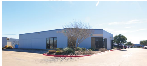
BLDG B: BOARDWALK ST. $9.75/SF | OPEX - $3.64/SF