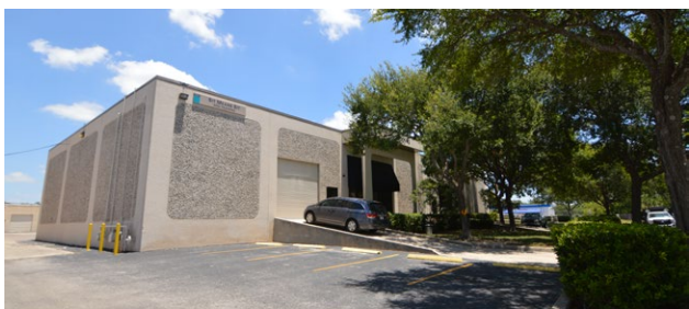
BLDG C: FREEDOM DR. $9.50/SF | OPEX - $3.50/SF