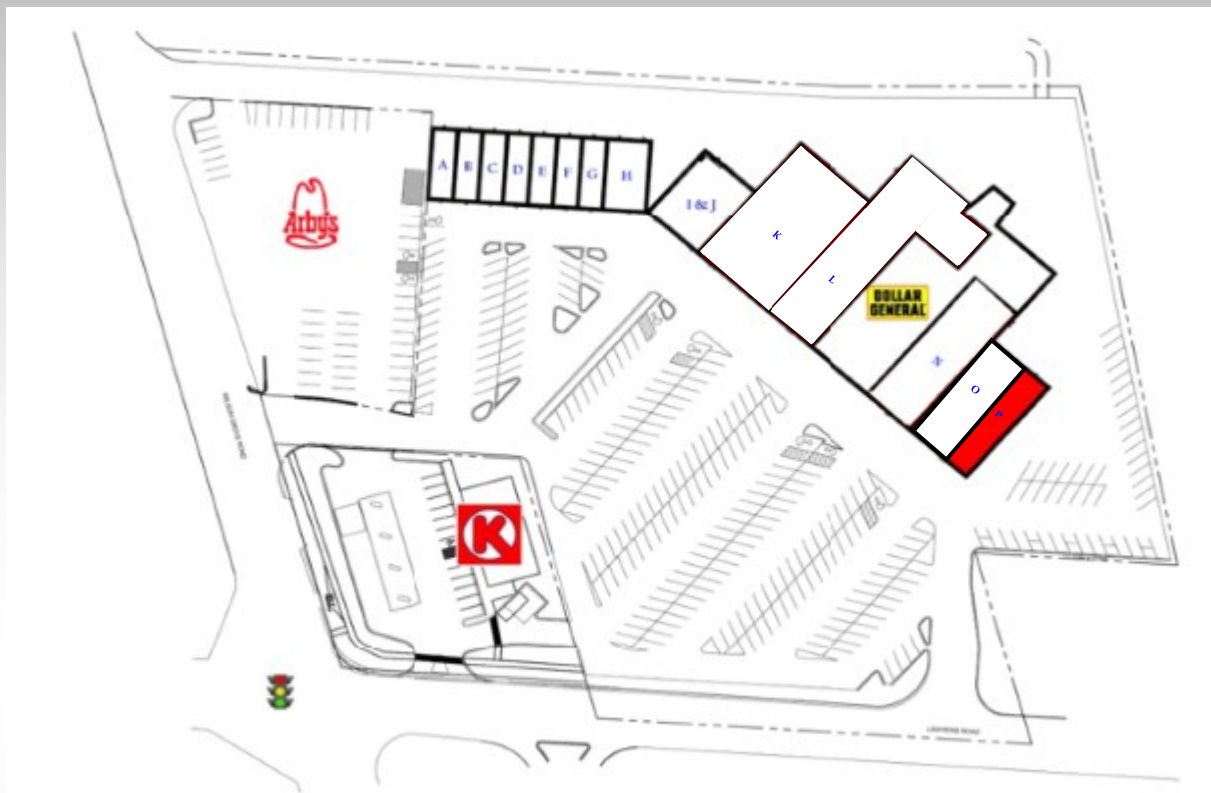
LAWYERS SQUARE - MINT HILL, N. CAROLINA