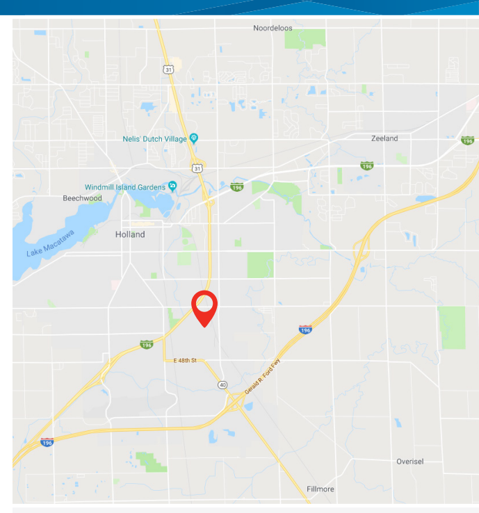
This document has been prepared by Colliers International for advertising and general information only. Colliers International makes no guarantees, representations or warranties of any kind, expressed or implied, regarding the information including, but not limited to, warranties of content, accuracy and reliability. Any interested party should undertake their own inquiries as to the accuracy of the information. Colliers International excludes unequivocally all inferred or implied terms, conditions and warranties arising out of this document and excludes all liability for loss and damages arising there from. This publication is the copyrighted property of Colliers International and/or its licensor(s). ©2016. All rights reserved.