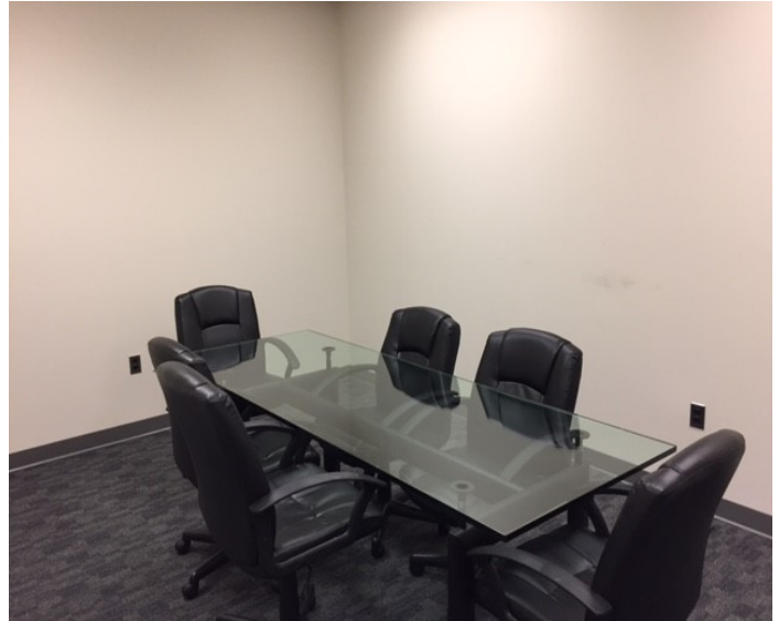
Shared Conference Room