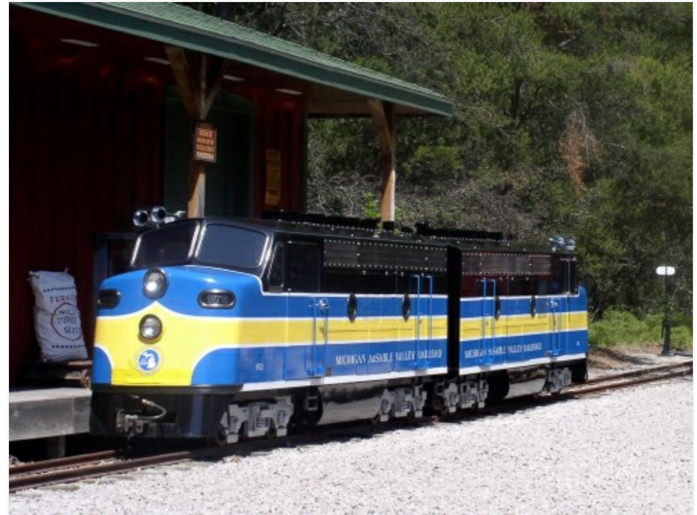
Diesel Engine with 2 custom F-7's