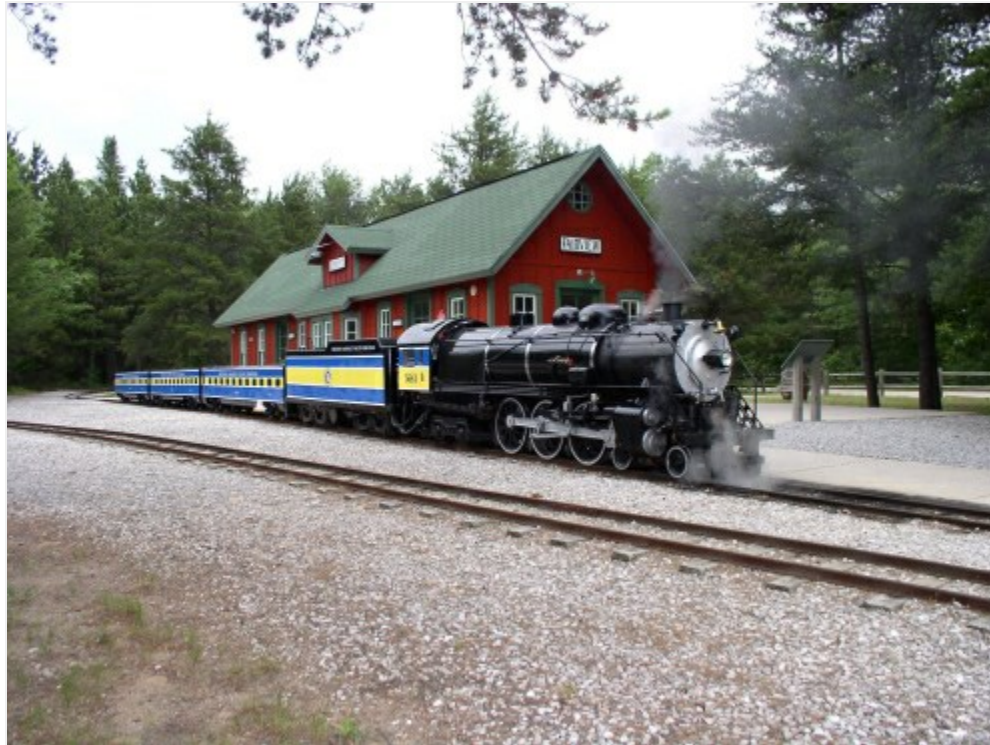
Hudson Steam Locomotive at Victorian Station