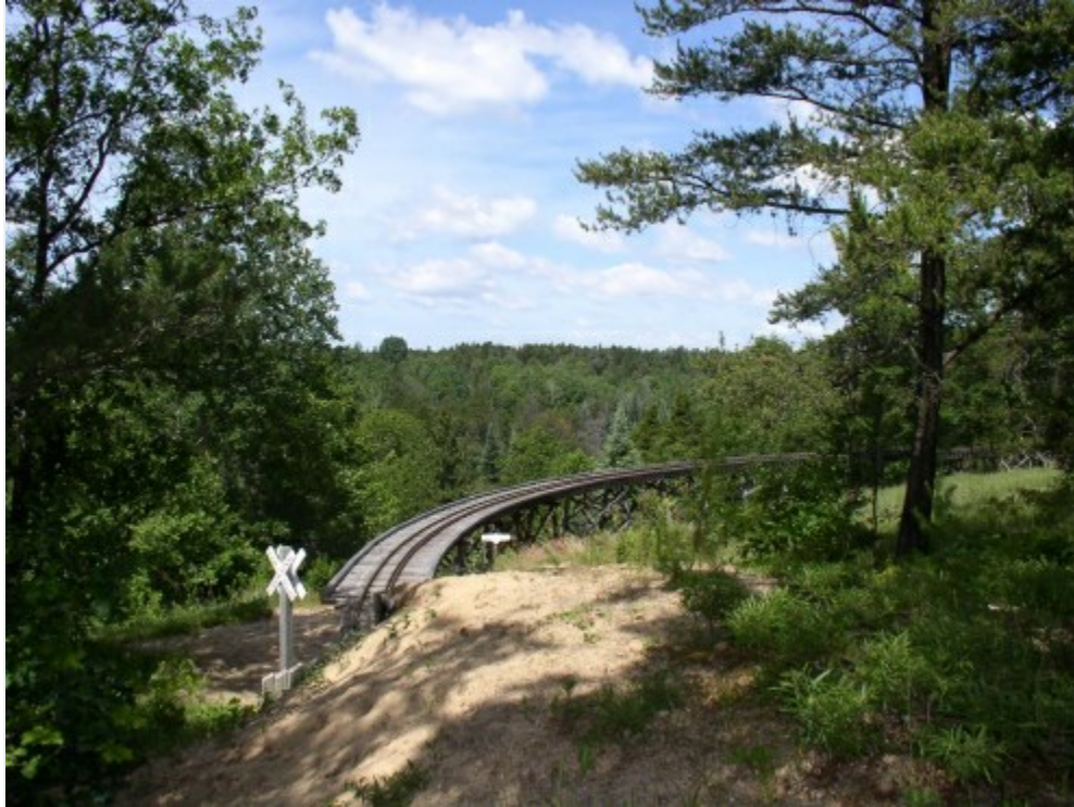
View of Valley and Trestle