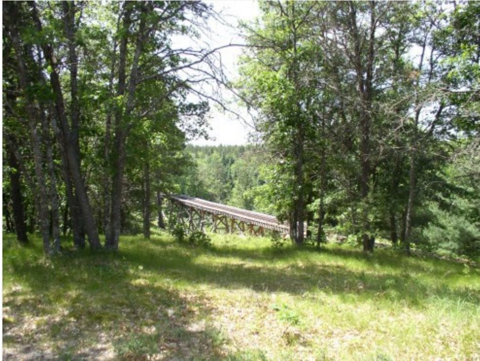
A view of the Valley