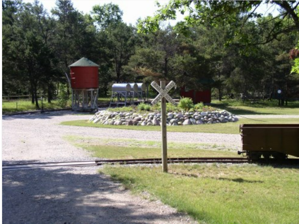
Railroad Crossing and Water Tower