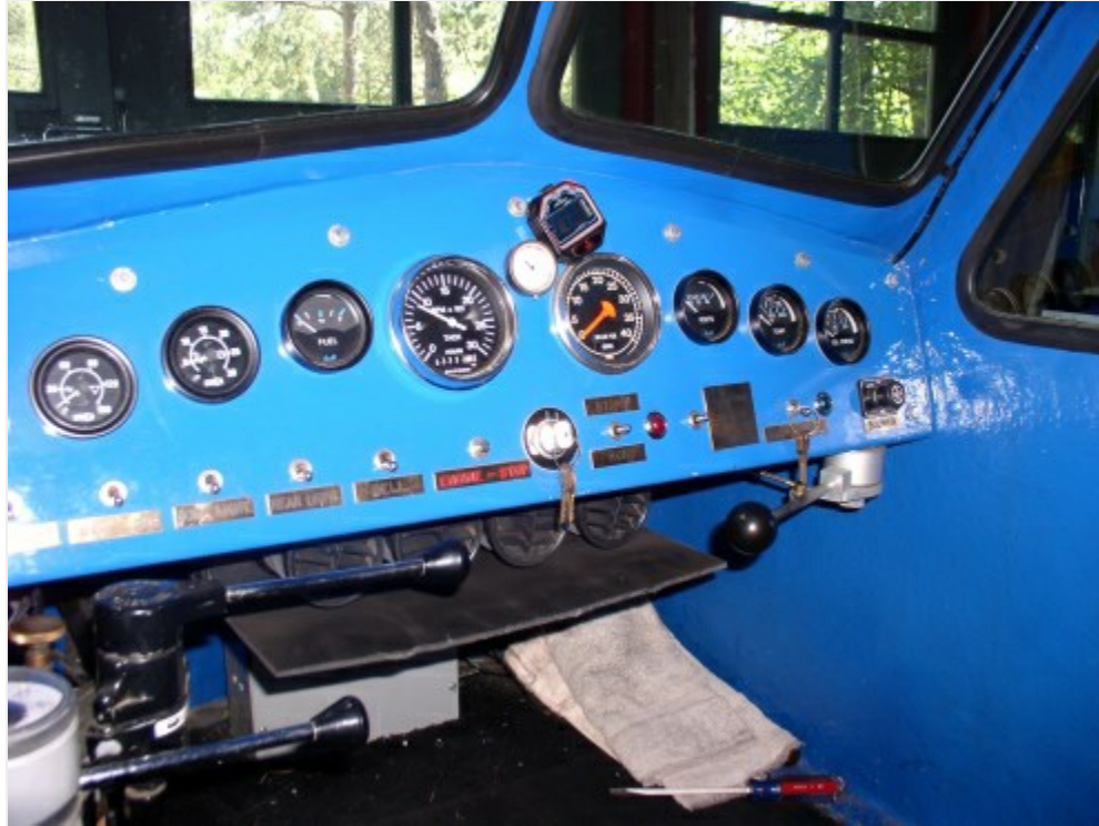
Cab of Engine