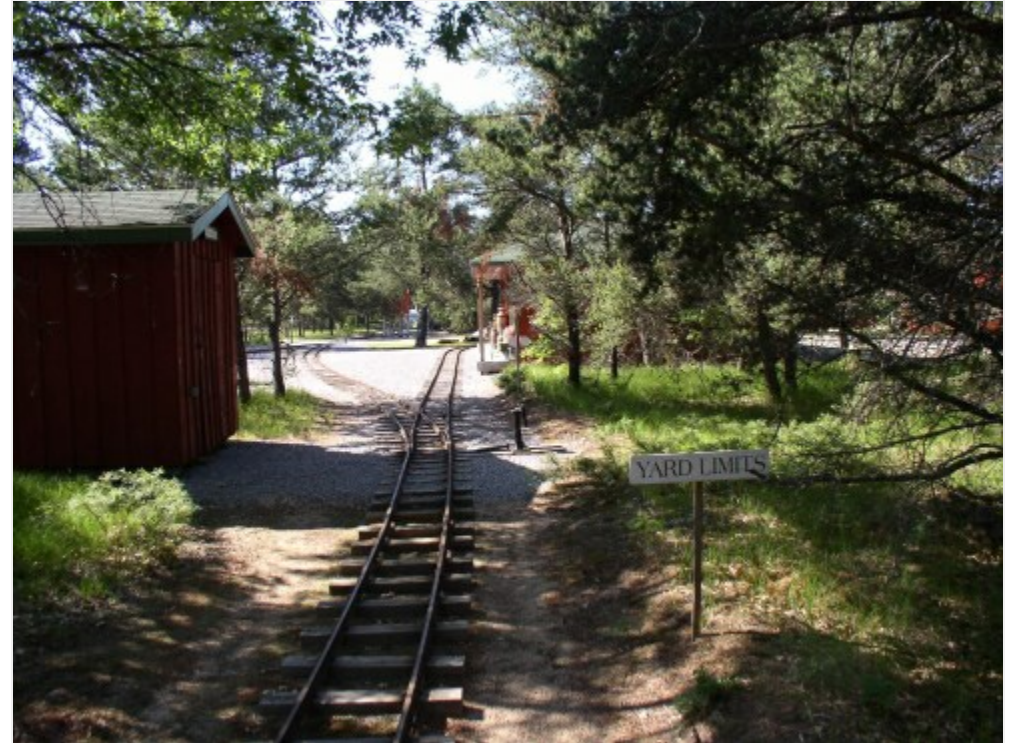
Track through the Forest