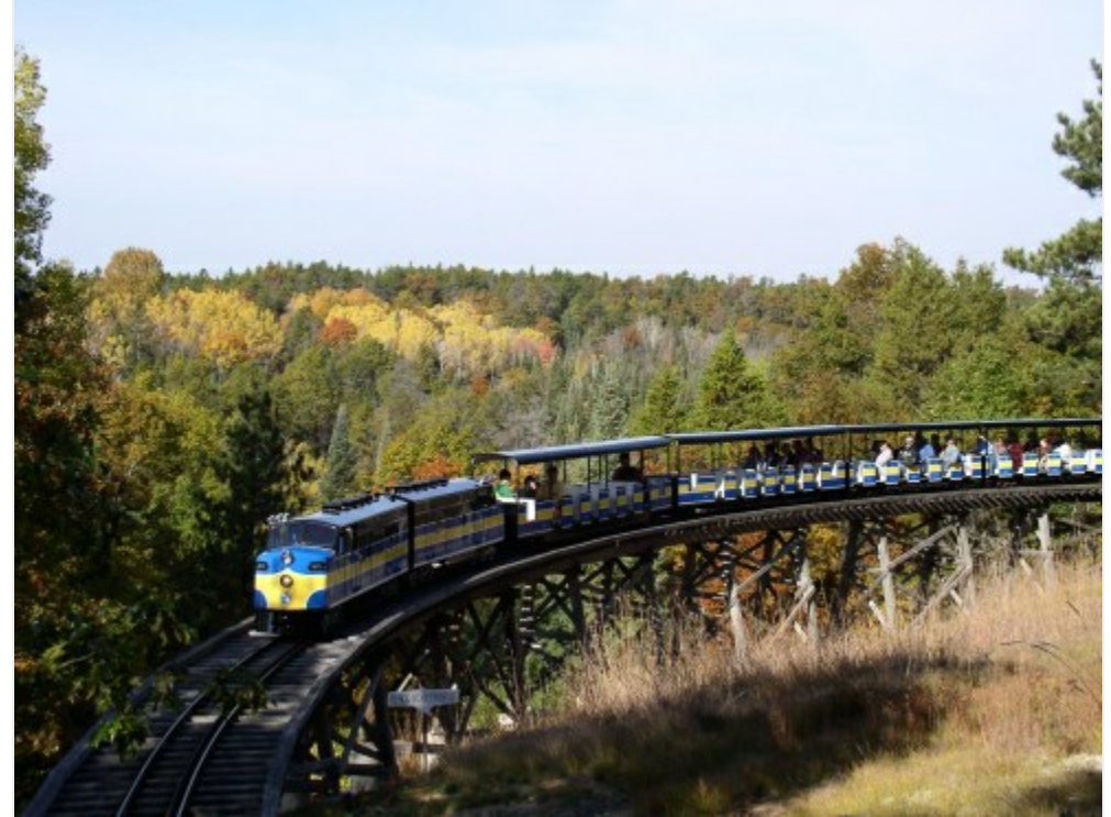
220' Wooden Trestle