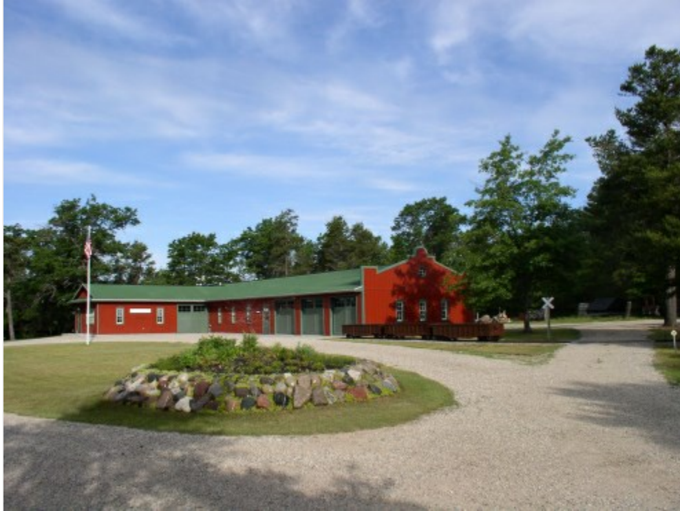
Office and Warehouse