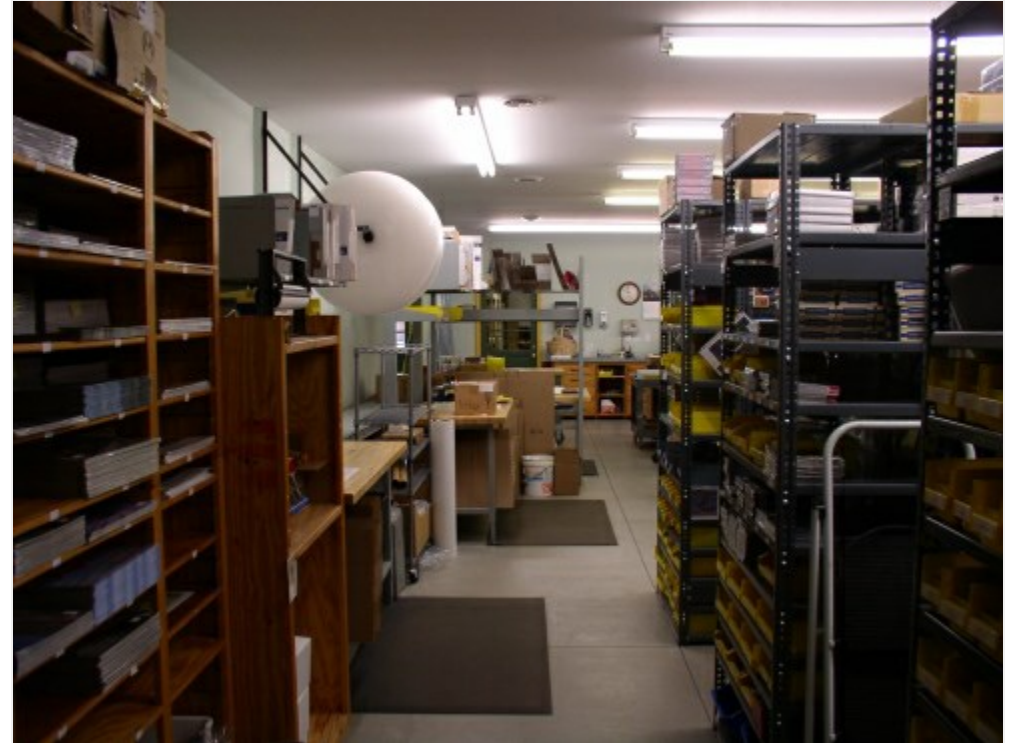
Shipping and Receiving