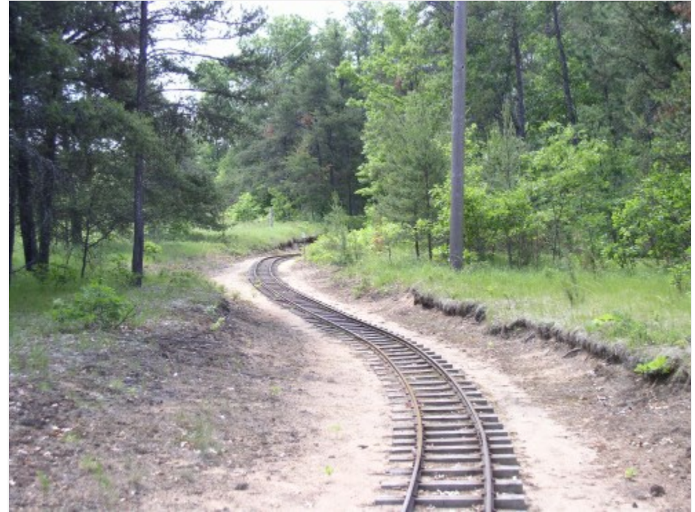
Stretch of Track