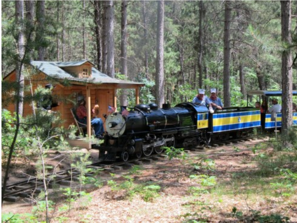
Stop at the Cabin in the Forest