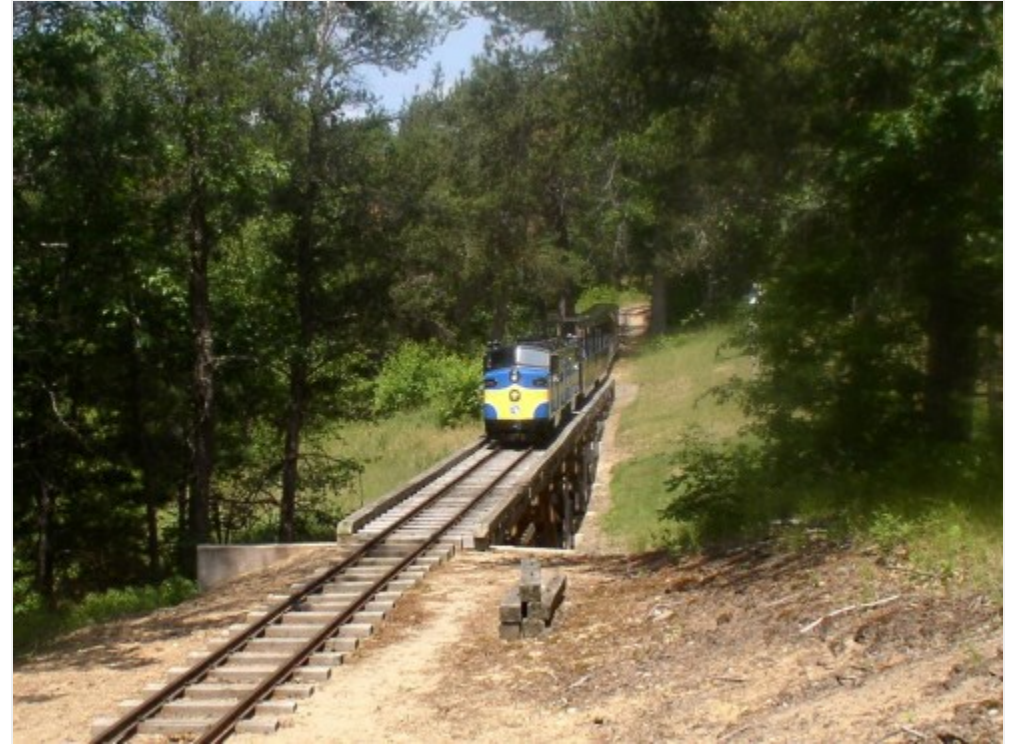
Diesel on the Trestel