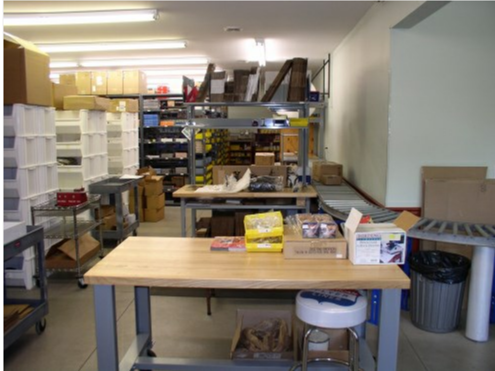
Shipping and Receiving