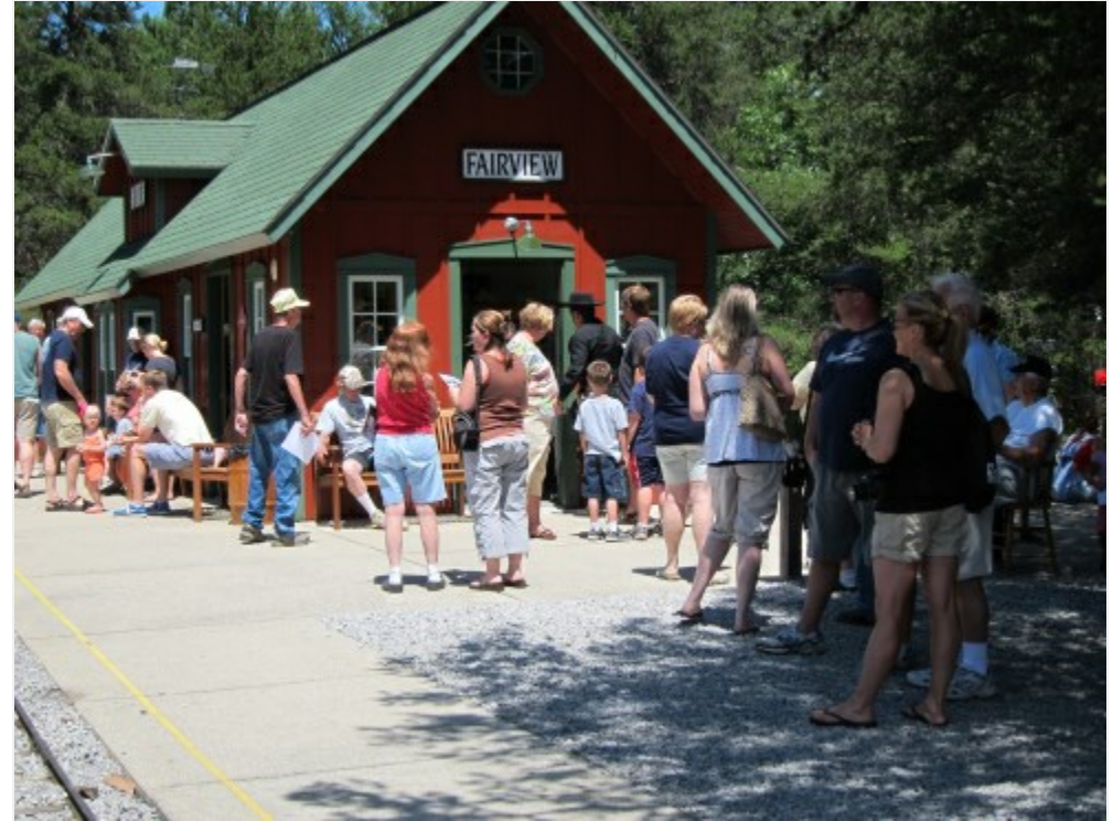
Railroad Station & Gift Shop