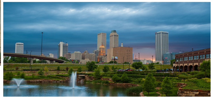
CBD Views/Centennial Park