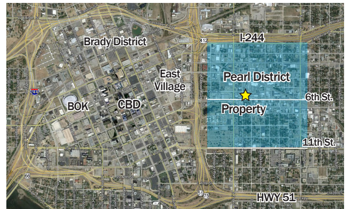
Tulsa CBD/Pearl District Area Map

The information contained herein is believed to be accurate but is not guaranteed as to accuracy and may change or be updated without notice.