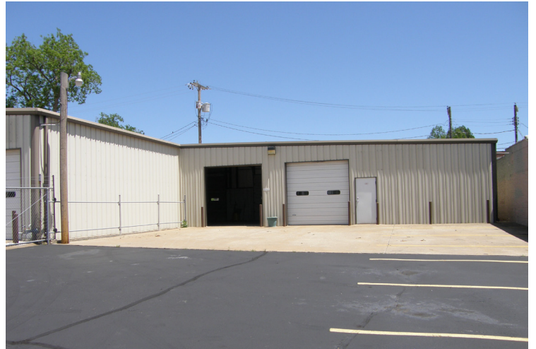
569 Peoria Building