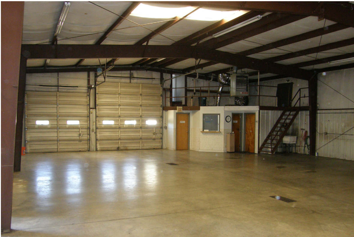
Warehouse with OH Doors