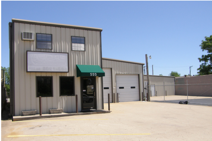
555 Peoria Building