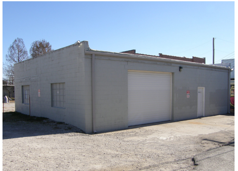
Exterior Back of Building