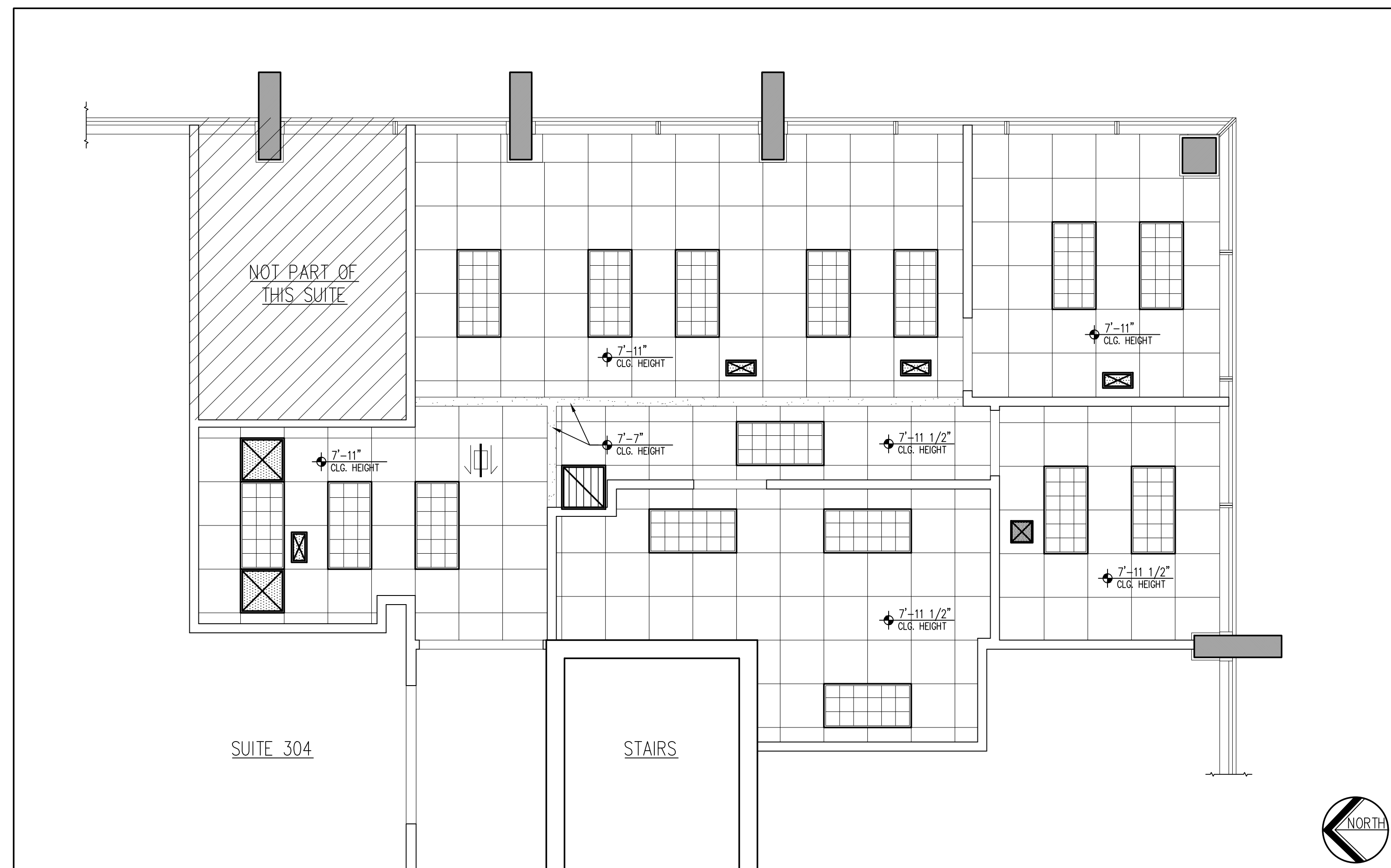
3 Existing Reflected Ceiling Plan A0.11 SCALE: 1/4" = 1'-0"