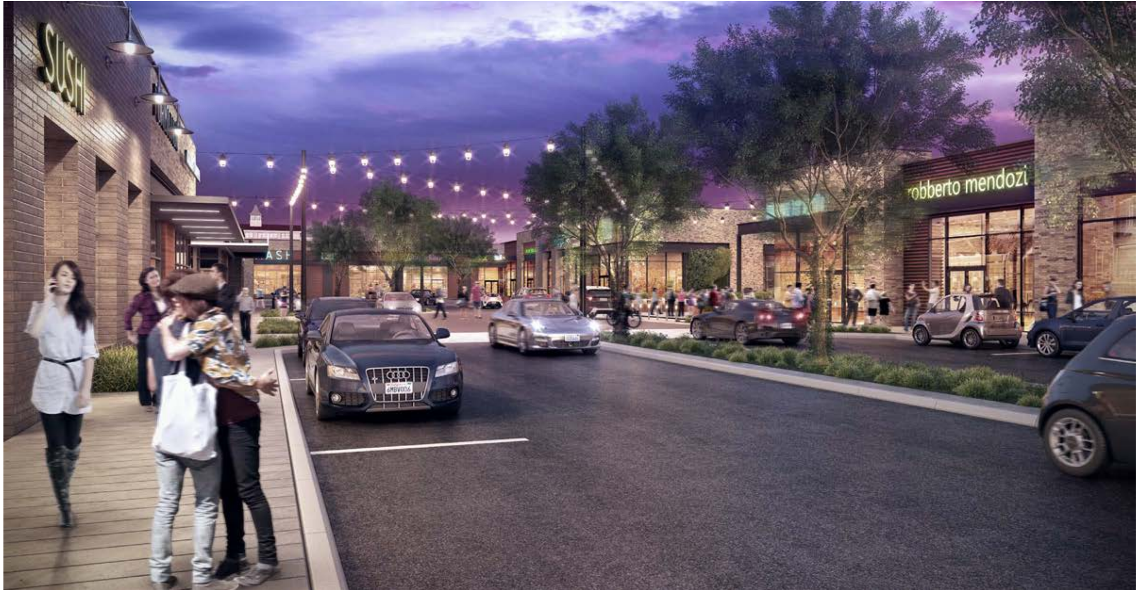
VIEW FROM MAIN STREET