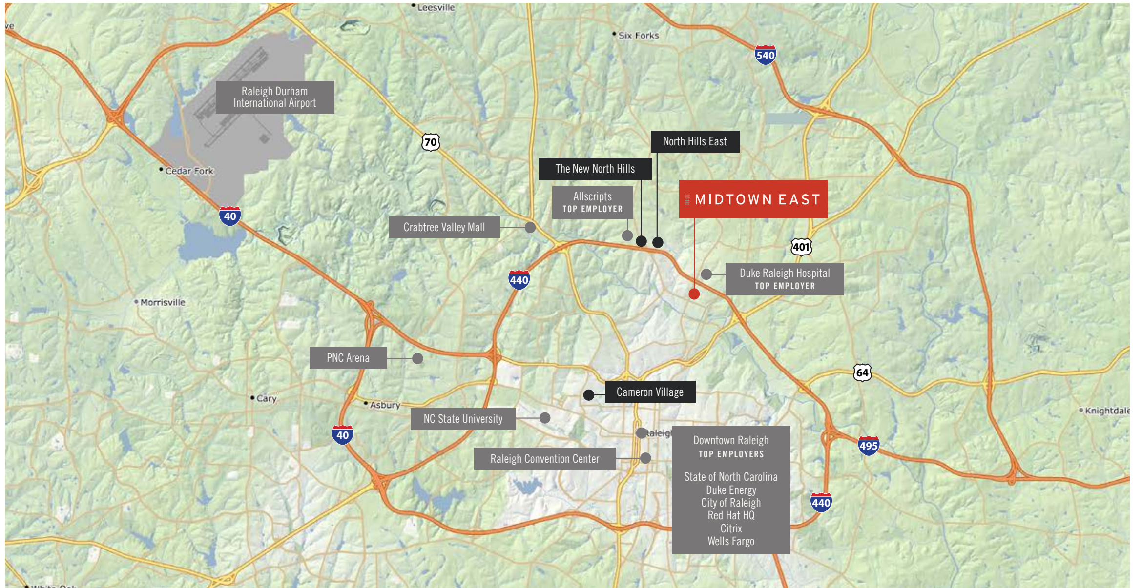
CITY OF RALEIGH TOP EMPLOYERS AND POINTS OF INTEREST