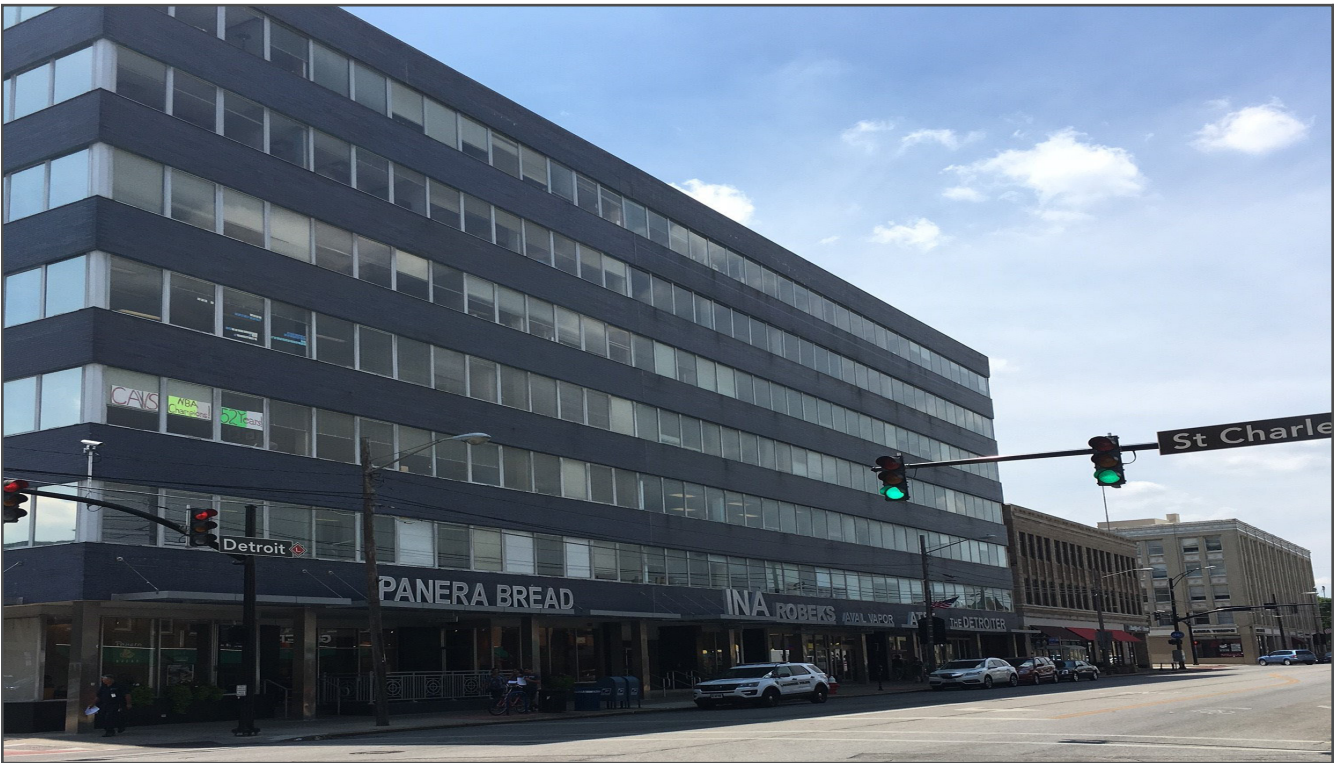
VIEW OF BUILDING