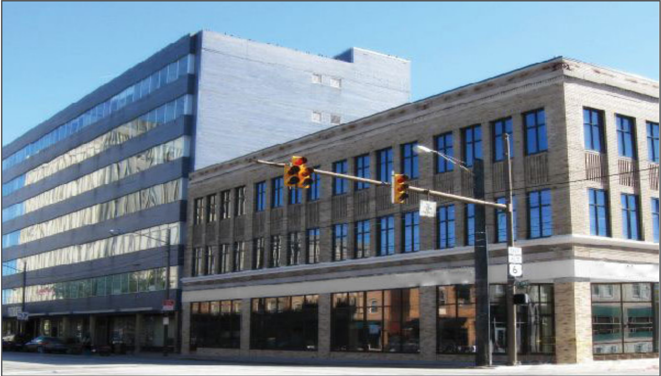
VIEW OF BUILDING