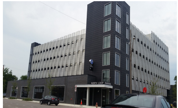
New Secure Parking Ramp