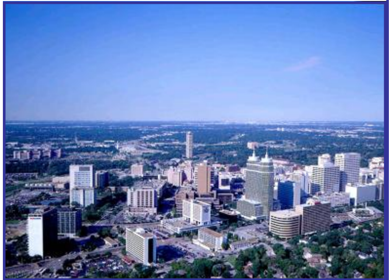
Texas Medical Center