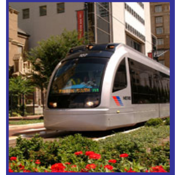
Metro Light Rail