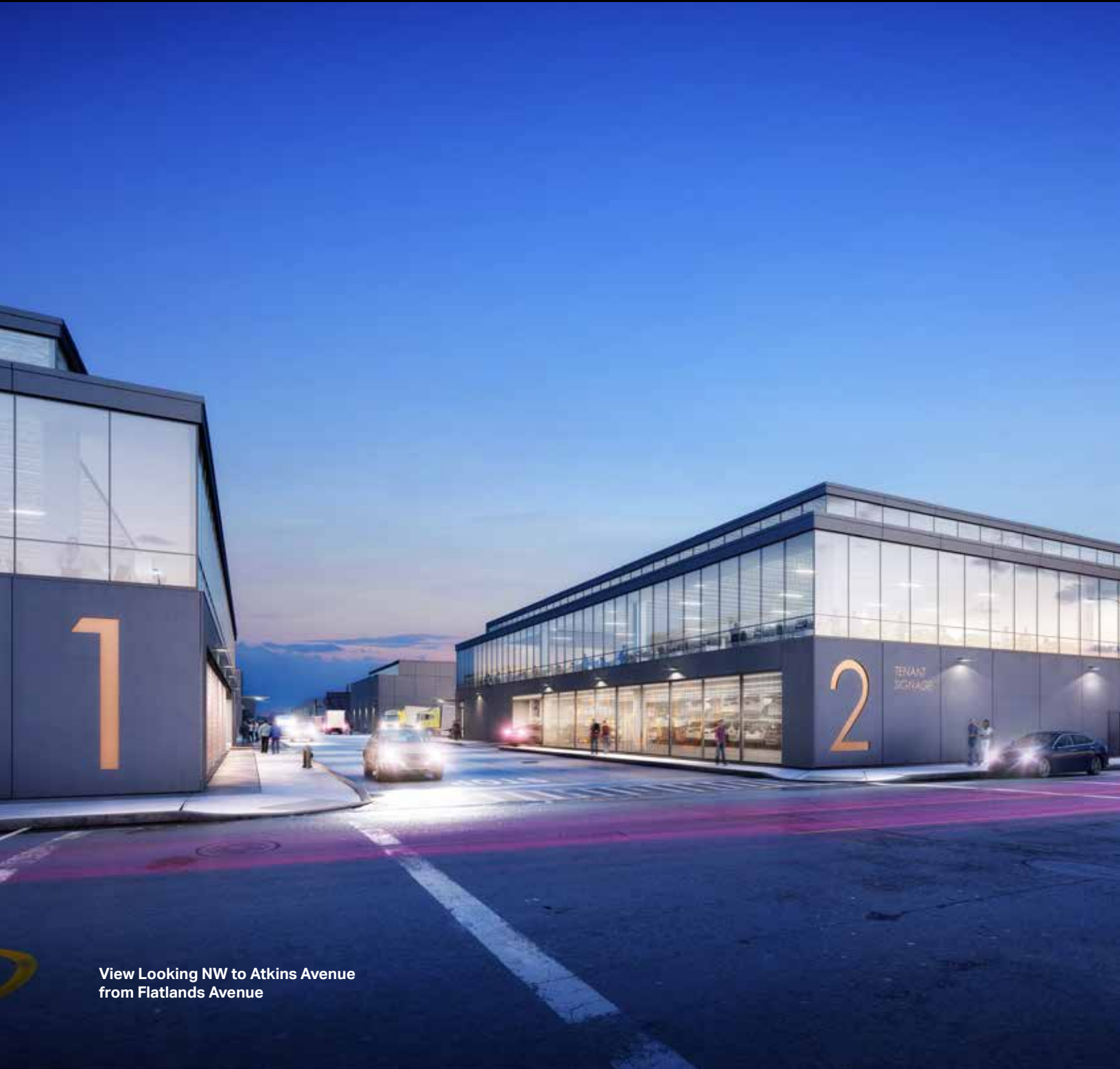
View Looking NW to Atkins Avenue from Flatlands Avenue

Brooklyn Logistics Center is located 4.6 miles from JFK Airport and 10.3 miles from Manhattan at the intersection of Flatlands and Atkins Avenues, in Brooklyn, NY. Immediate proximity to FedEx Ground and efficient regional drive times define the site's multi-borough connectivity.