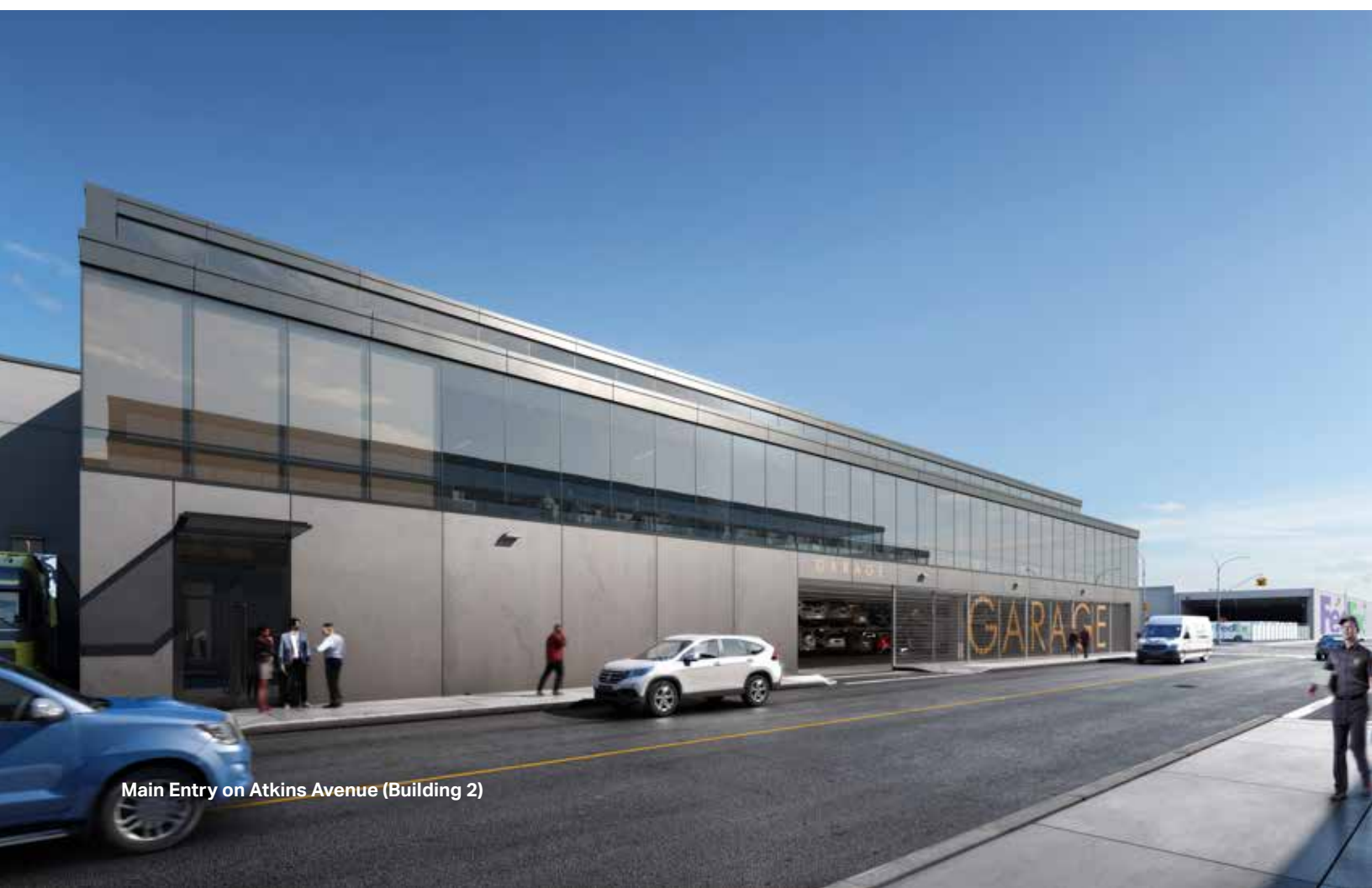
Main Entry on Atkins Avenue (Building 2)