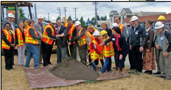
SR 704 Cross Base Highway Ground Breaking Ceremony July 30, 2008