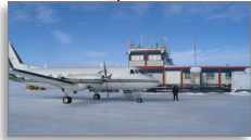
DOWNTOWN AIRPORT (7 MILES)