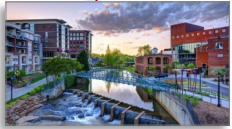
DOWNTOWN GREENVILLE (9 MILES)