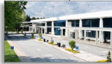
GSP INTL AIRPORT (5.9 MILES)