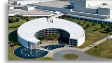
BMW (5.5 MILES)