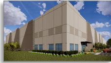
GARLINGTON NORTH (SITE)