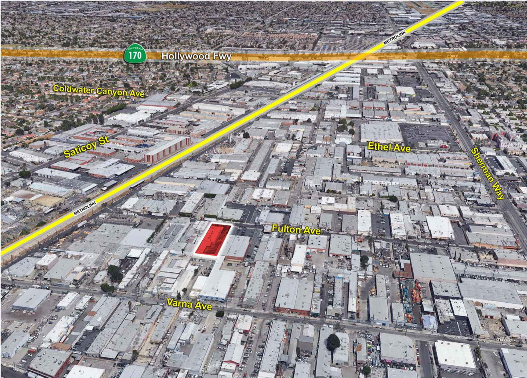
INDUSTRIAL / RETAIL / CREATIVE OFFICE BUILDING FOR LEASE OR SALE 7359 Fulton Avenue, North Hollywood, CA 91605