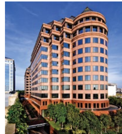
Providence Towers Dallas, Texas