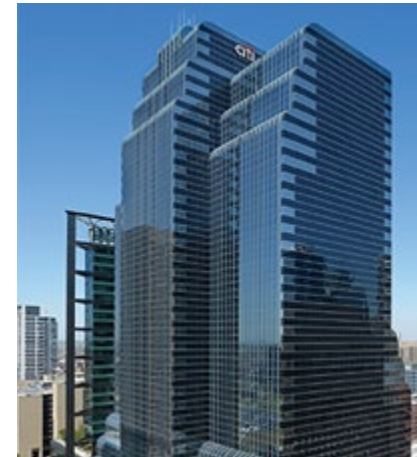
500 West Madison Chicago, Illinois