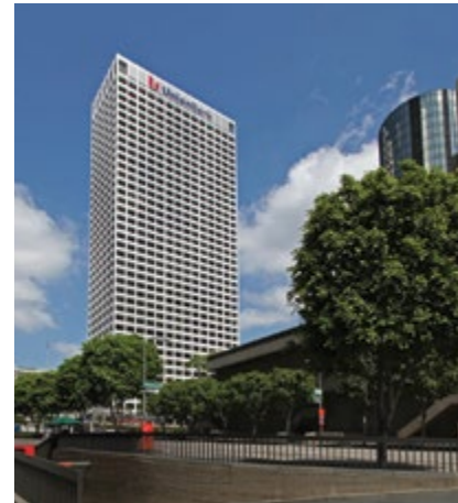
Union Bank Plaza Los Angeles, California