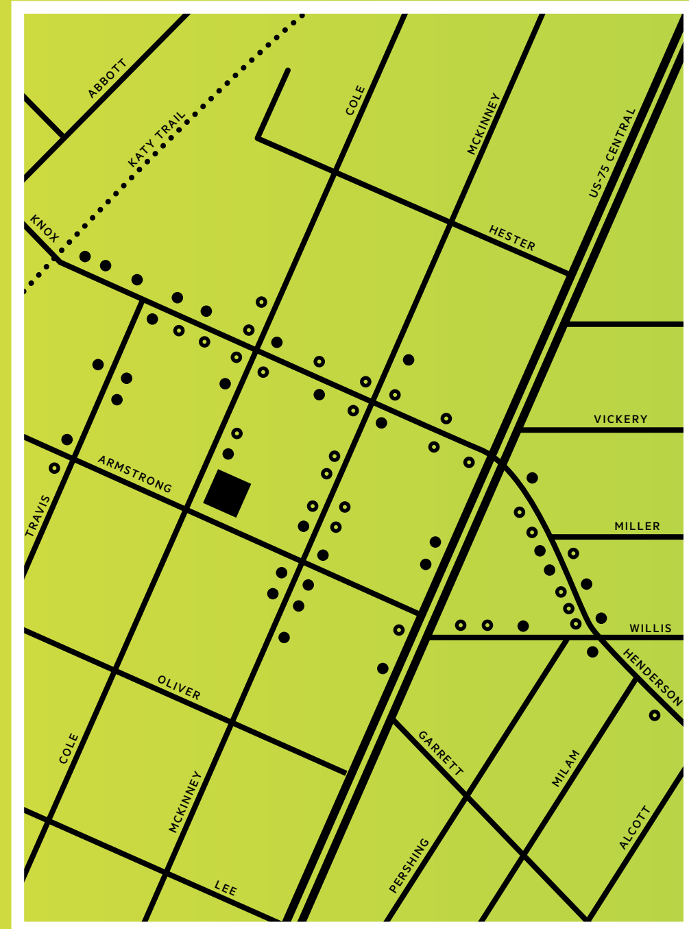
■ HIGHLAND PARK PLACE ○ SHOPPING ● BARS AND RESTAURANTS