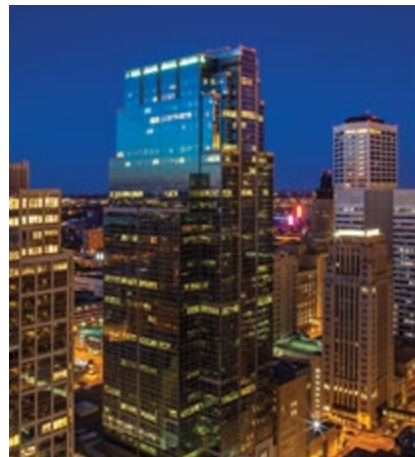
RBC Plaza Minneapolis, Minnesota