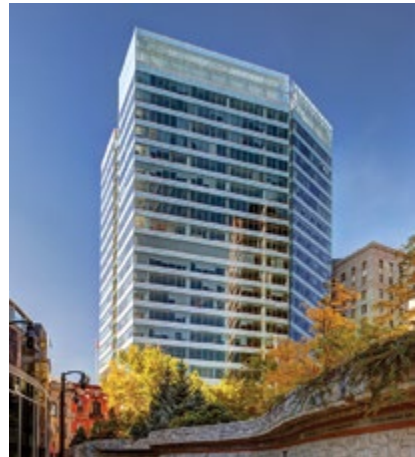
222 Main Salt Lake City, Utah

We know it's not only where you do business that matters, but how you do business. Our "hands-on" approach has led us to many successes, gaining us profound trust with our clients. At KBS, we believe our people are our greatest asset and our tireless efforts to conduct good business has not only earned us repeat investment opportunities, but also formed long lasting relationships.