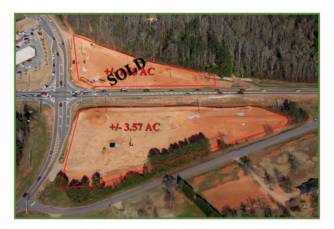
Aerial Photo Facing East