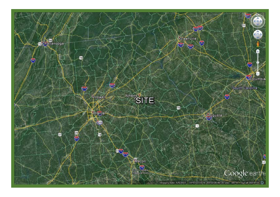
Map of North Georgia