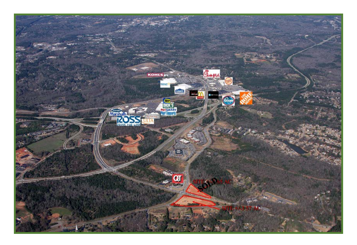
Aerial of Area