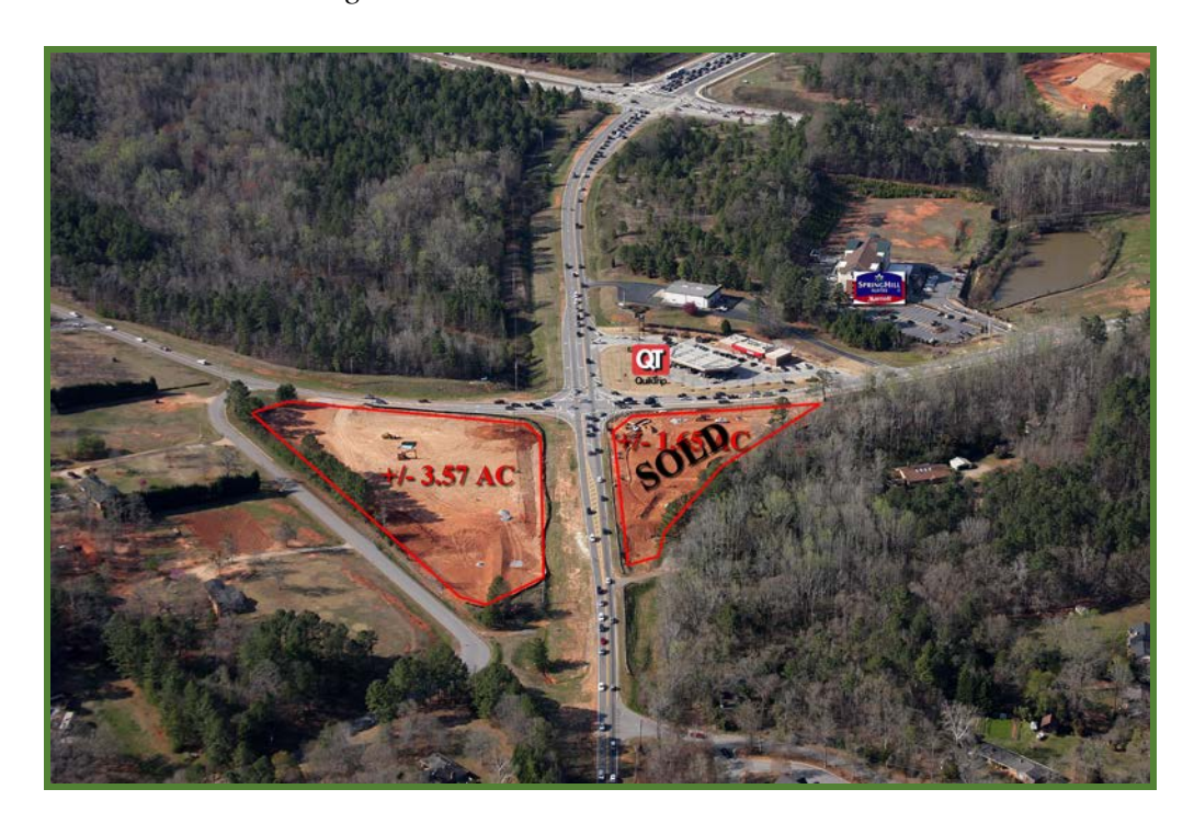
Aerial Photo Facing North