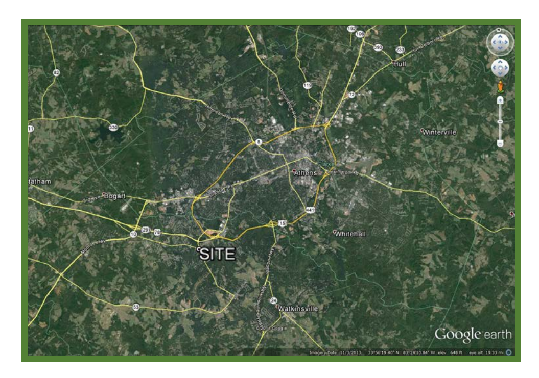
Map of Athens, GA