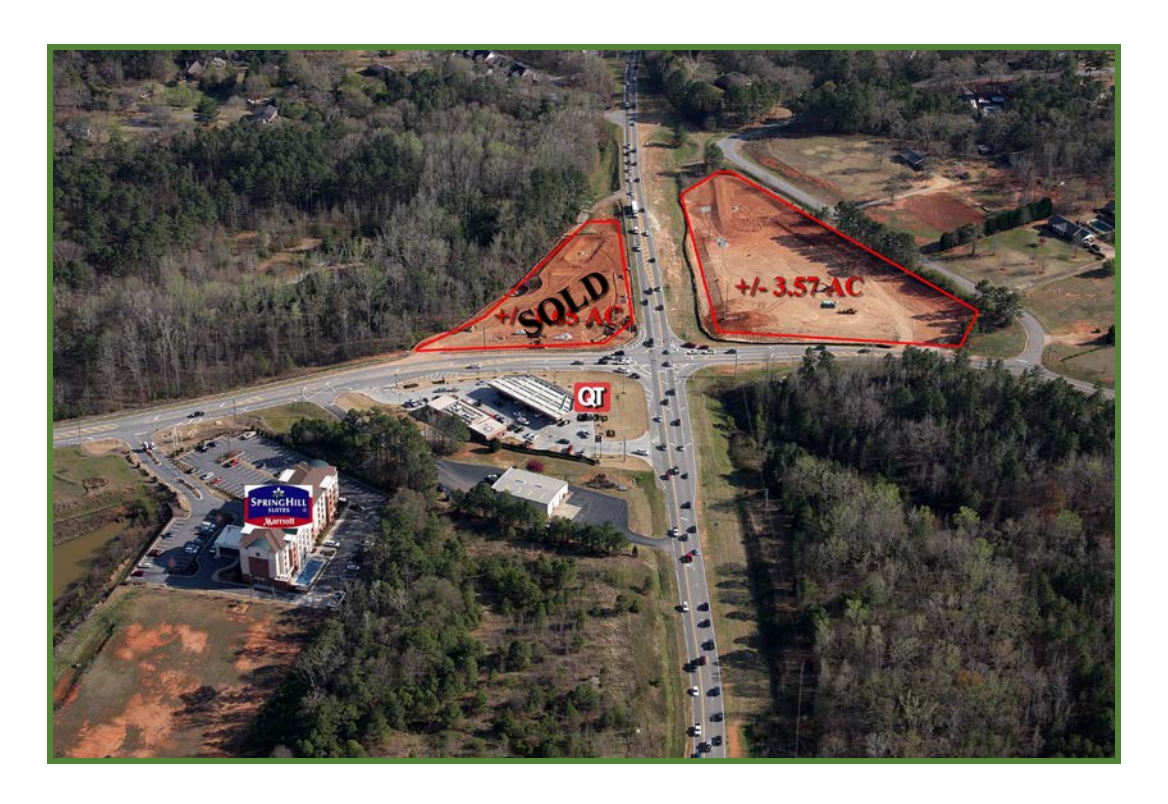
Aerial Photo Facing South