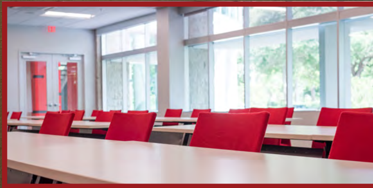
On-site conference center