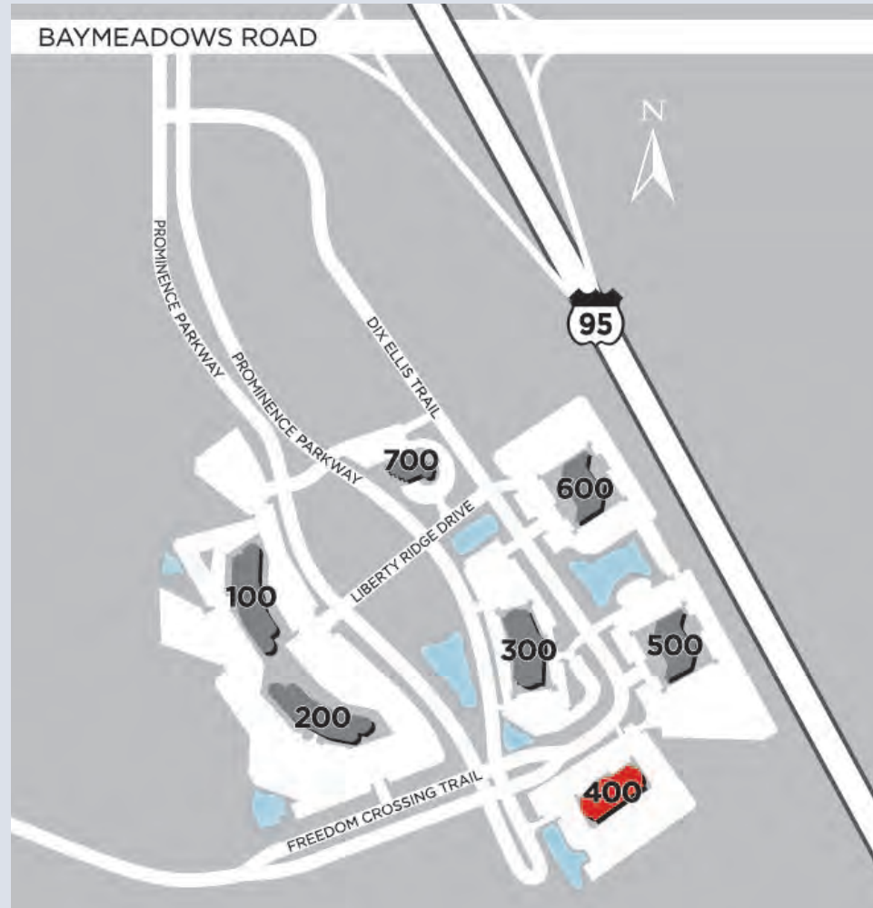
Prominence is a seven-building office park south of Baymeadows Road and adjacent to Interstate 95