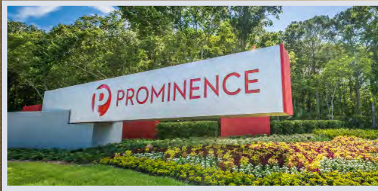
New park entrance