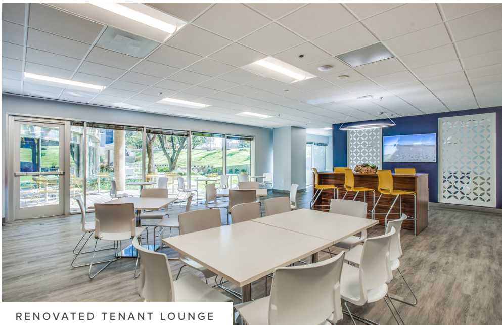
RENOVATED TENANT LOUNGE