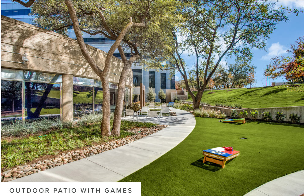
OUTDOOR PATIO WITH GAMES