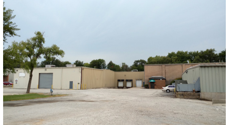
Buildings "A", "B", "C" and "D"