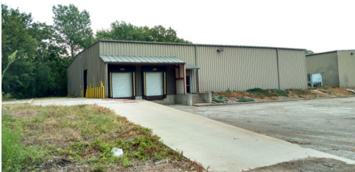
Building "E" Loading Ramp