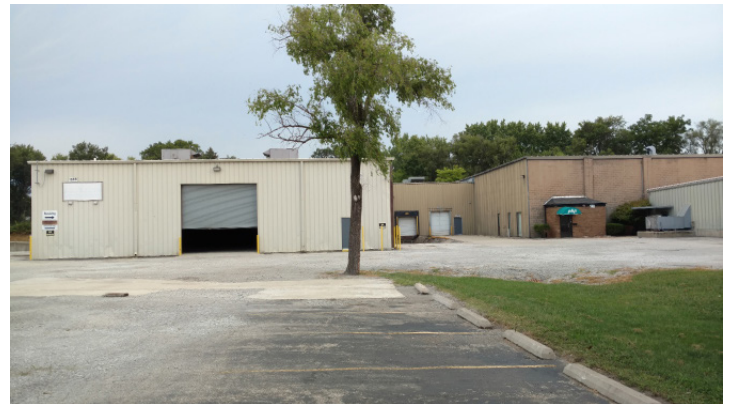
Building "D" Overhead Door