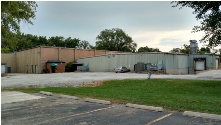
Building "A" & "B"