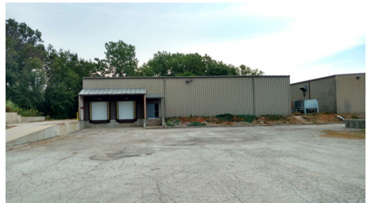
Building "E" Loading Docks