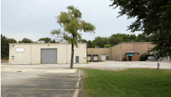
Building "D" & Building "C" Loading Docks