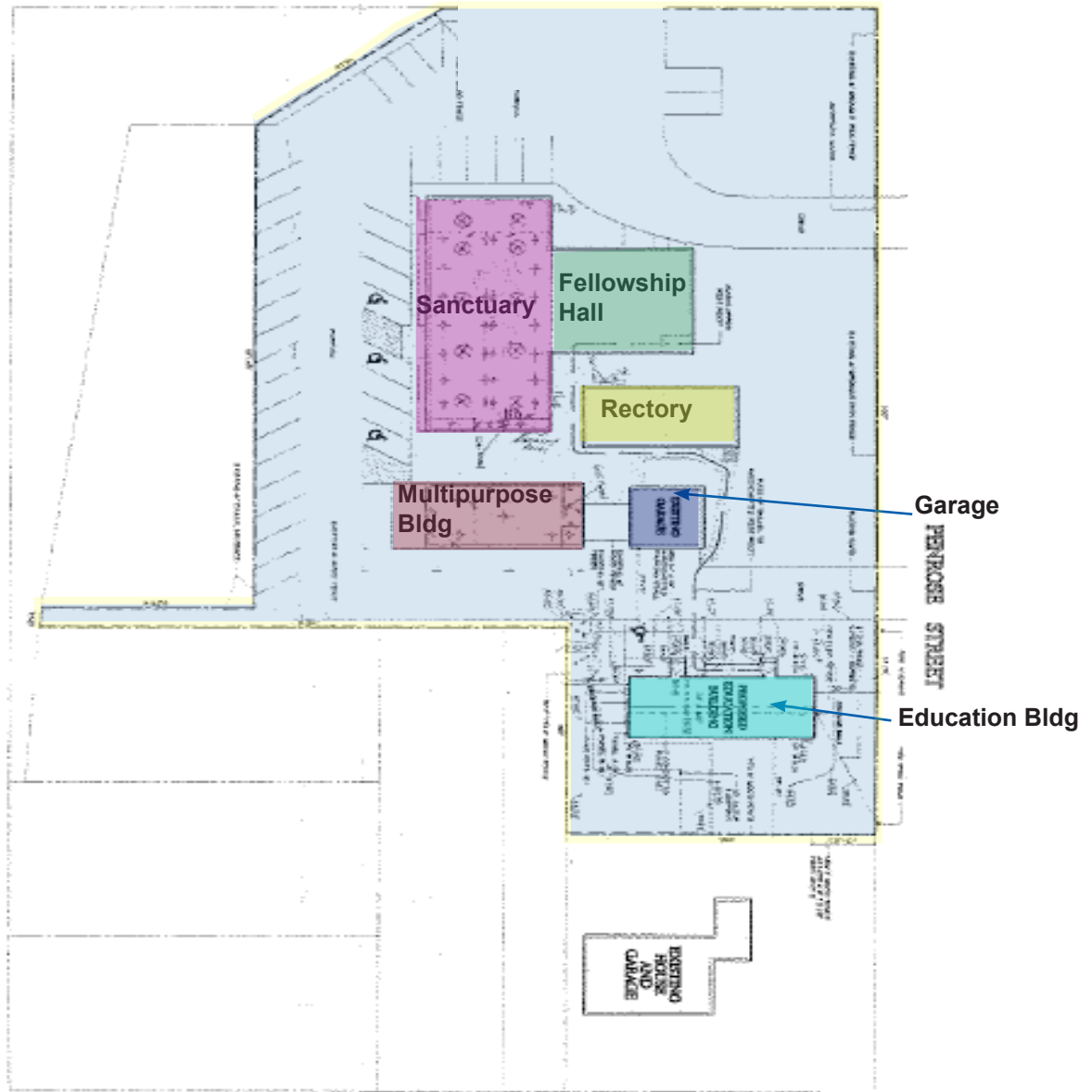
SITE PLAN OF CHURCH FACILITY

1541 Jessie Avenue, Sacramento, CA 95838