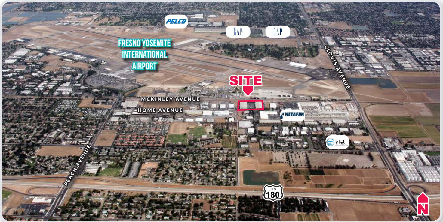
FRESNO TRUCKING DISTRIBUTION MAP