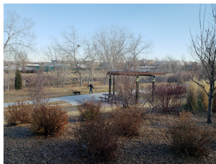
Dog Walker Trail